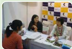
Shanghai venue, China (Nov. 9-10)

Our university has established locally staffed offices in Surabaya and Shanghai. Prospective students can ask about studying at Kumamoto University in their native languages at either office. Exchange activities with Indonesia and China are expected to be further promoted.