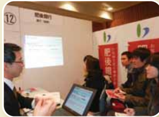
International students collecting corporate information

This year marks the third such event, and 16 companies, including Kumamoto-based firms and more than 110 international students, participated. Approximately 40 students from Kumamoto University attended the fair. They were enthusiastically listening to the explanations given at company booths, and asked a lot of questions. The program also included a panel discussion with former international students who landed jobs at companies in Kumamoto, and a lecture that offered useful job interview tips.