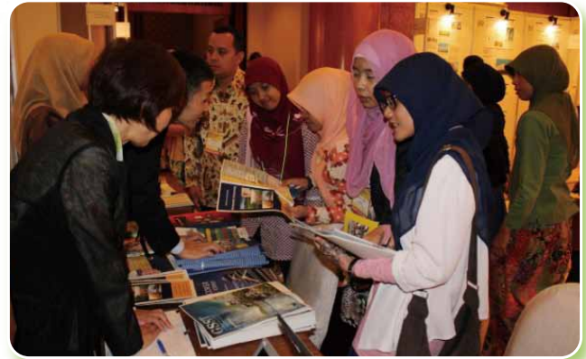
Indonesian students asking eagerly on the opportunity for studying in Kumamoto University