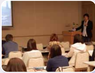
Presentation by student who studied abroad

The speakers reported on their experiences of studying abroad and the achievements they earned through them, with photos and anecdotes. Approximately 40 participants, including students who hope to study abroad in the future, attended the session, asked many questions, and helped the session to conclude as a success. The participants commented that the presentations of those who studied abroad were very informative and stimulating.