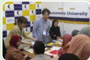
Surabaya venue, Indonesia (Oct. 26)

In Shanghai, over 70 people visited our booth and asked questions about the departments, graduate schools and life in Kumamoto. Former exchange students at Kumamoto University who are now studying at a university in China, and students who have been sent to a Chinese university from Kumamoto University, explained life at Kumamoto University from student viewpoints.