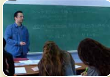
Class taught by a former student of Kumamoto University

Social and Cultural Sciences) teaches a course in the Japanese Language Education Department. Also, for the first time last year, a student from this department came to Kumamoto University to study. Although an exchange agreement has not been concluded with this university, the eventual establishment of a partnership is expected.