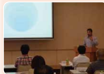
Participants at the training class

From September 3 to September 5 2013, Kumamoto University held an FD Training Program for the Globalization of Education for the purpose of improving English communication and teaching skills at Kumamoto University.