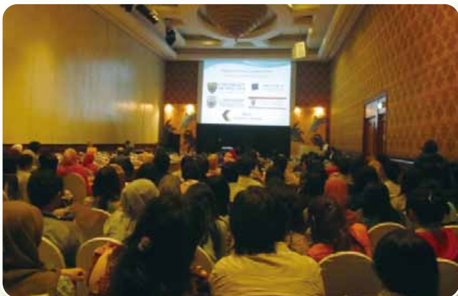
Latest research introduction by the researchers from two universities in Indonesia and Kumamoto University

Through the Forum, Kumamoto University forged closer ties with Indonesian universities. Further advancement of international exchanges between the two countries can be expected.